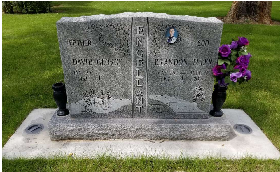
Upright marker in Section 12

**Any service after 3:00pm on a weekday or 2:00pm on a Saturday will incur an overtime charge of $435