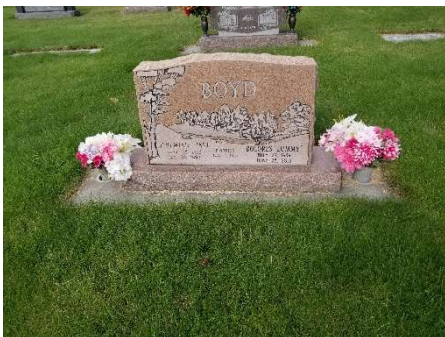
Upright double headstone centered over two graves

**Any service after 3:00pm on a weekday or 2:00pm on a Saturday will incur an overtime charge of $435