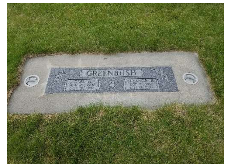
Flat double headstone centered over two graves