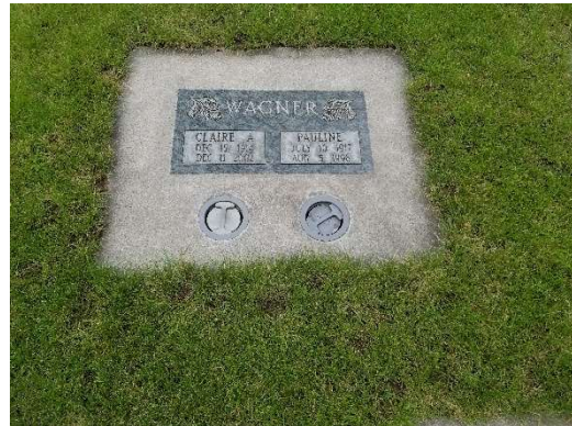
Double headstone centered over two cremation graves