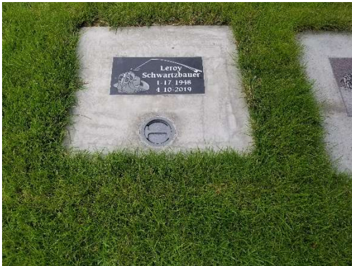
Single headstone on one cremation grave

**Any service after 3:00pm on a weekday or 2:00pm on a Saturday will incur an overtime charge of $435