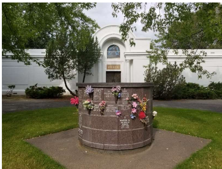
Columbarium in front of the mausoleum

***Any service after 3:00pm on a weekday or 2:00pm on a Saturday will incur an overtime charge of $435