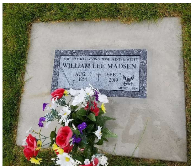
Single traditional grave with headstone only