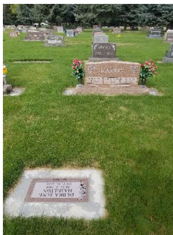
Upright double headstone with footstone