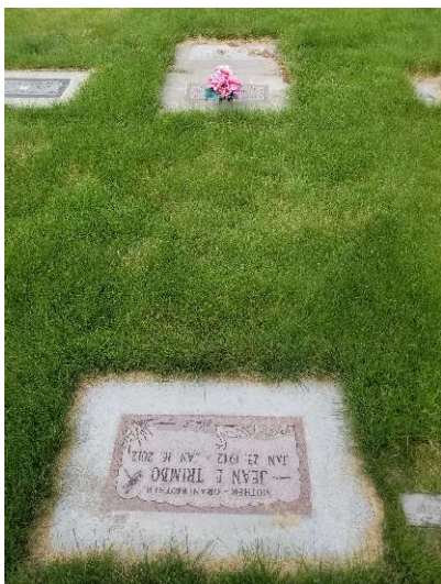
Single traditional grave with headstone and footstone

**Any service after 3:00pm on a weekday or 2:00 pm on a Saturday will incur an overtime charge of $435