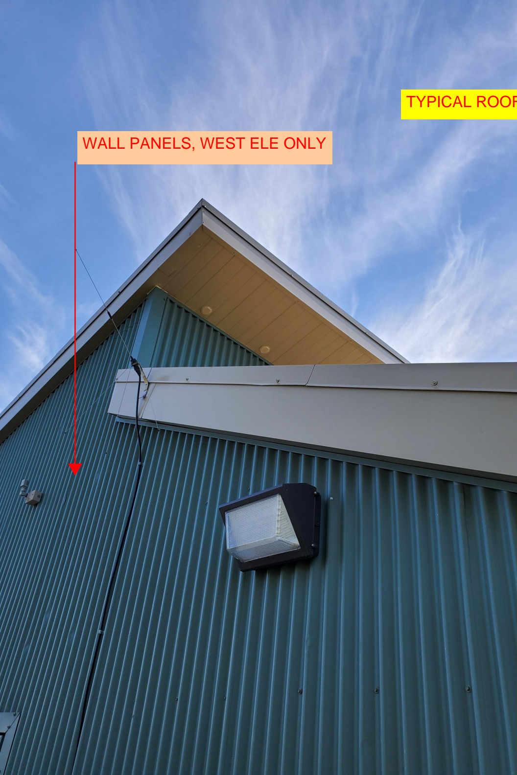
WALL PANELS, WEST ELE ONLY