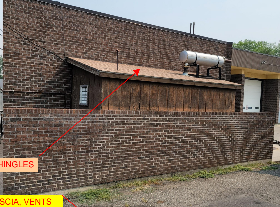
COPING, FASCIA, VENTS