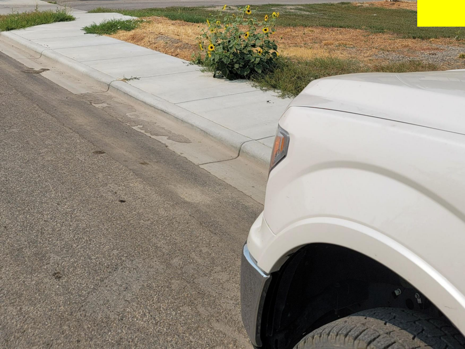
911 COMMUNICATION CENTER