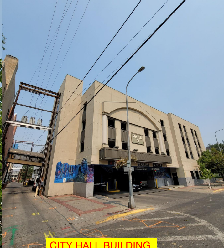
CITY HALL BUILDING