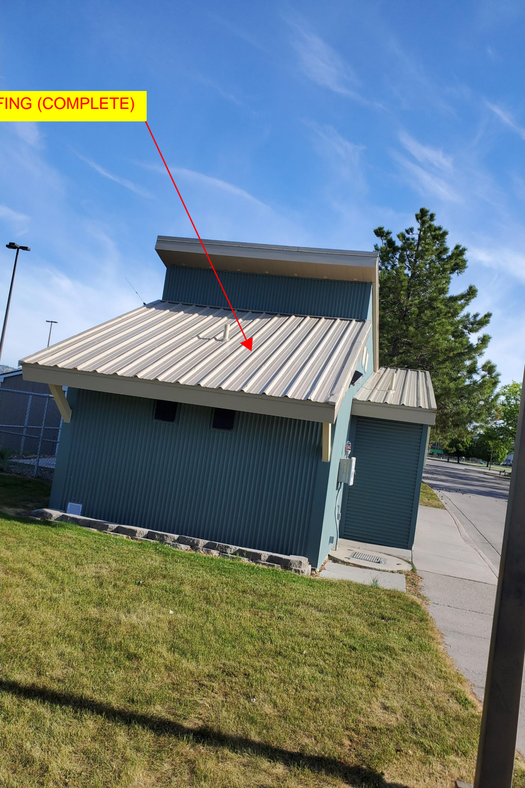
TYPICAL ROOFING (COMPLETE)