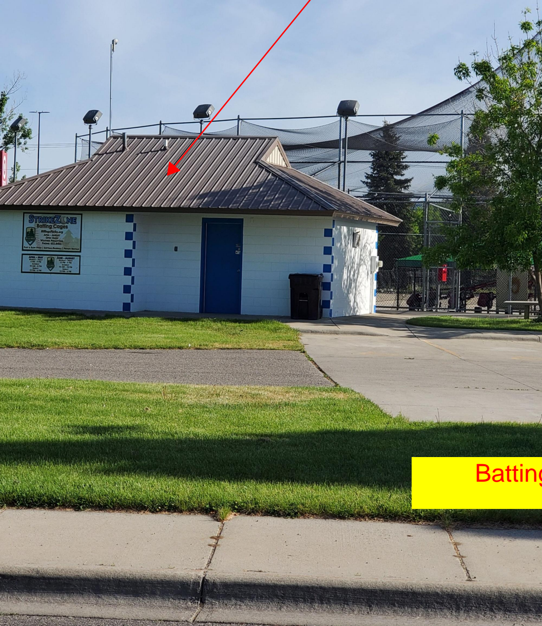
Batting Cage Bldg