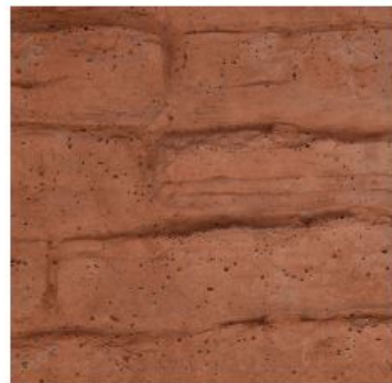
Dark Terra Cotta*