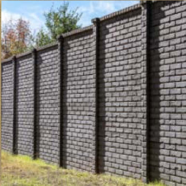
Option 1: Brick Texture