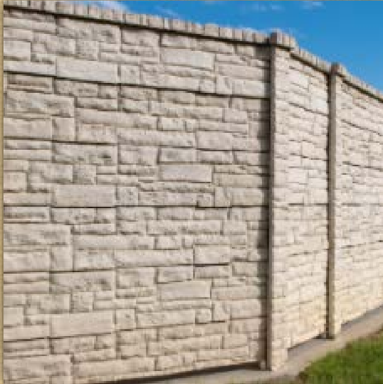
Option 2: Cobblestone Texture