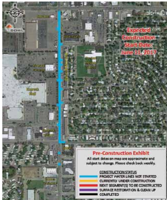
City of Billings W.O. 17-01, Schedule 1 24th Street West Water Main Replacement Project

The water line replacement on 24th Street West from Central Avenue to Monad Road estimated start date is June 5th. The waterline that is being replaced is in the center of the street, so most of the work will be done primarily at night. The completion is scheduled for September 20th.