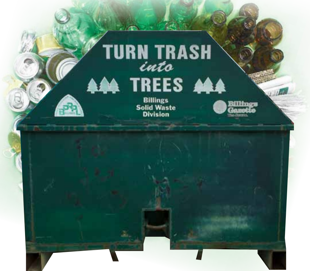
A "TURN-TRASH-INTO-TREES" BIN AS IT LOOKS TODAY AFTER 19 YEARS OF RUGGED USE. ALL BINS WILL BE GETTING A "FACELIFT" THIS SUMMER. KEEP A WATCH OUT FOR THEIR NEW LOOK!

For a recent article on EAB effects of EAB to urban forests please see: http://www.startribune.com/minneapolis-and-st-paul-are-losing-thousands-of-trees-to-emerald-ash-borer/421687683/ With planning, the EAB arrival to Billings can be as much of a non-event as Y2K was to Armageddon and all we have to do to make it so is turn our trash into trees.