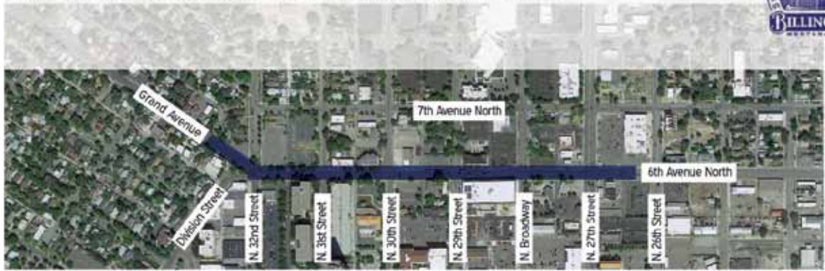
City of Billings W.O. 17-01, Schedule 3 6th Avenue North Water & Sewer Main Replacement Project

The estimated start of construction will be June 12th with sewer and waterline replacement from North 27th Street to Grand Avenue. There will be two lanes of traffic on 6th Avenue throughout the construction. There will be short closures on North 32nd and Division Streets which may include some night work. Grand Avenue will be constricted to one lane in each direction between Division Street and 2nd Street West during construction. The completion date is October 20th.